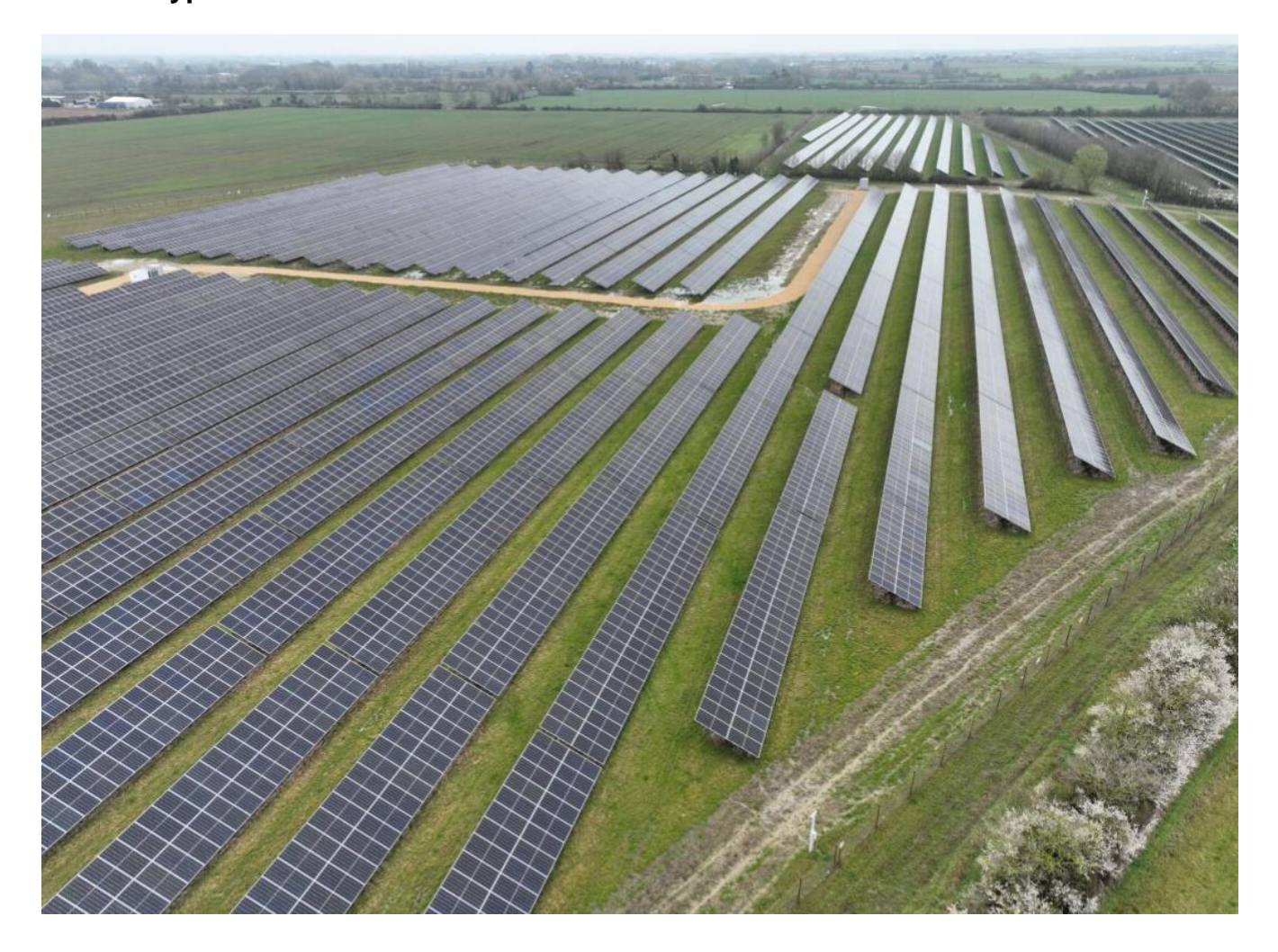
Plate 1: Typical Solar Panels