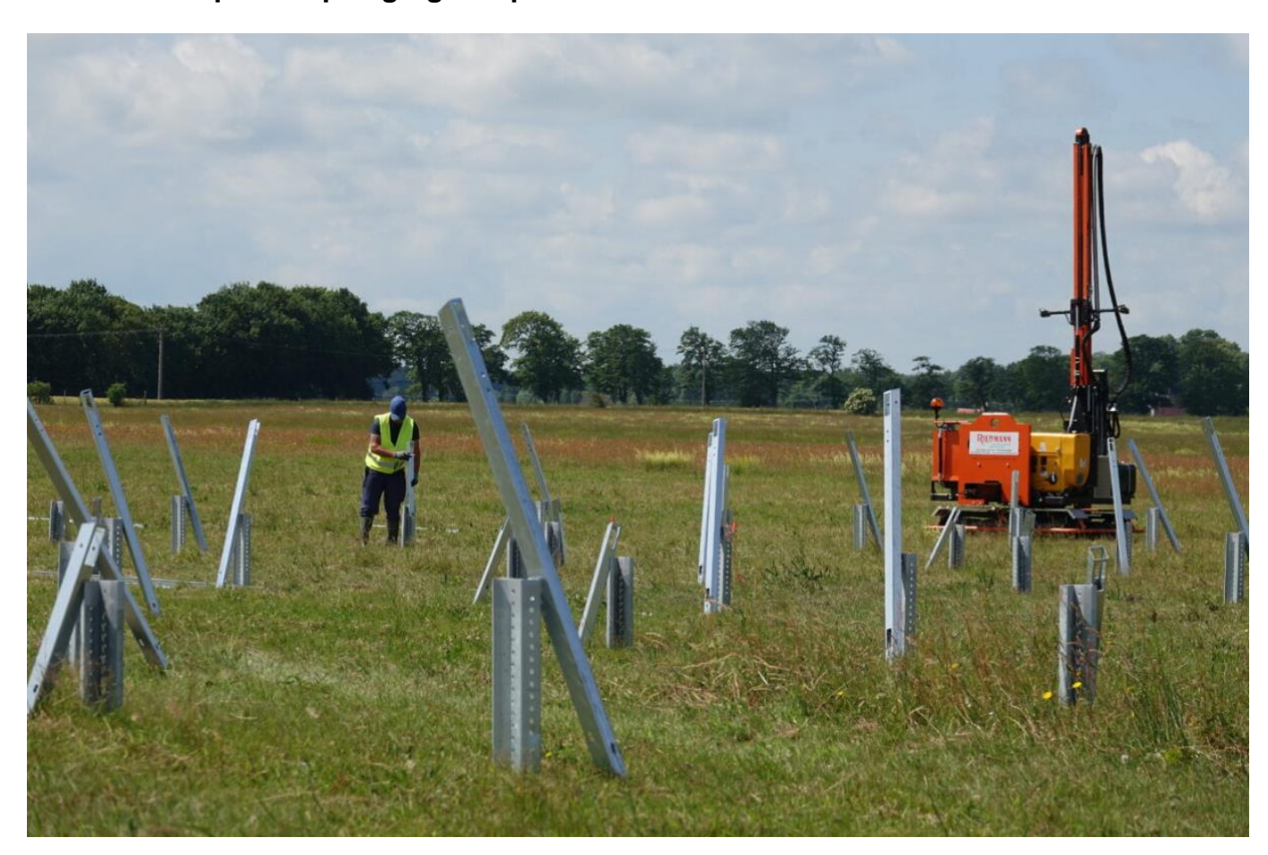
Plate 6: Example of a piling rig and piles