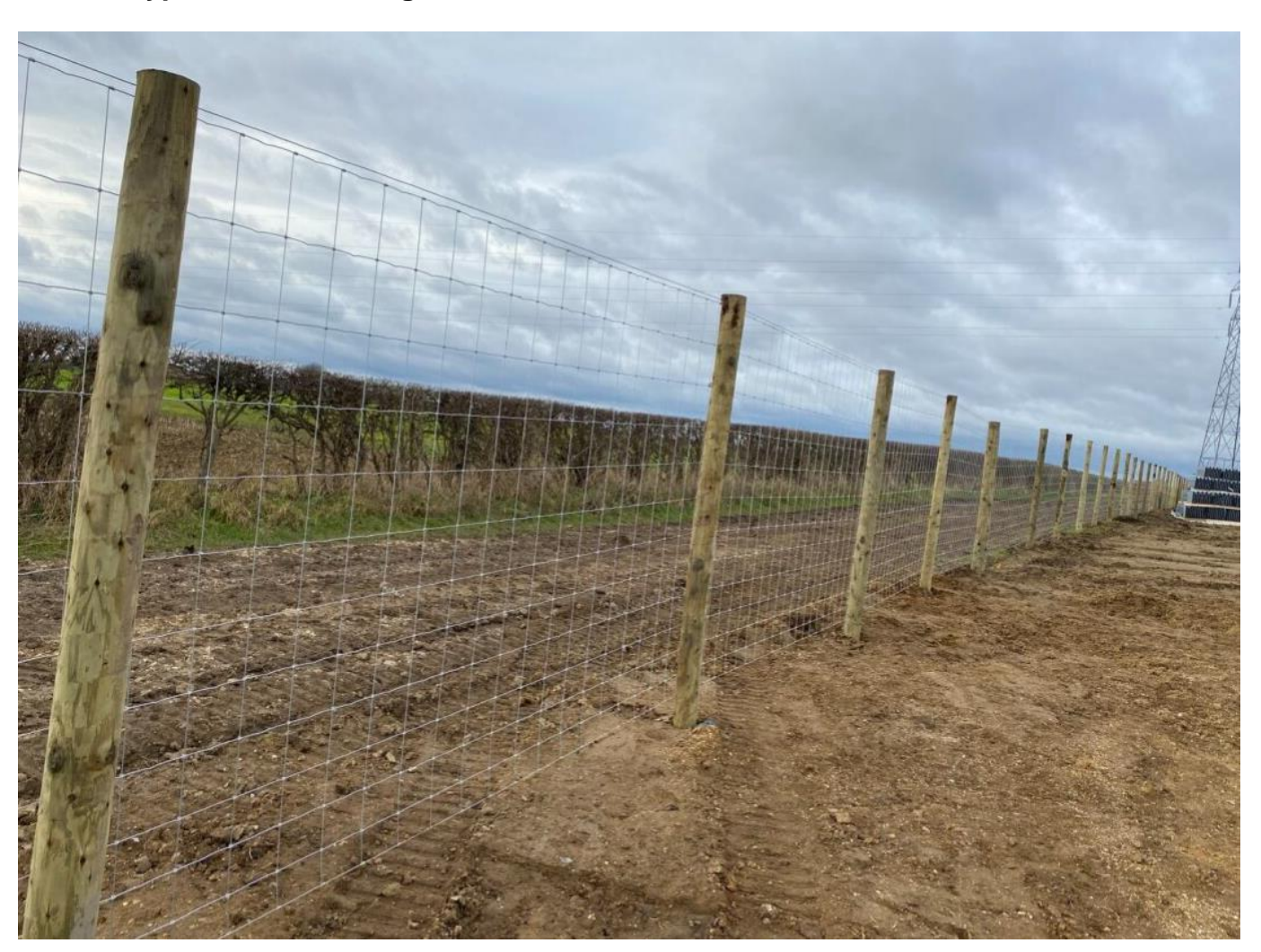
Plate 5: Typical Deer Fencing