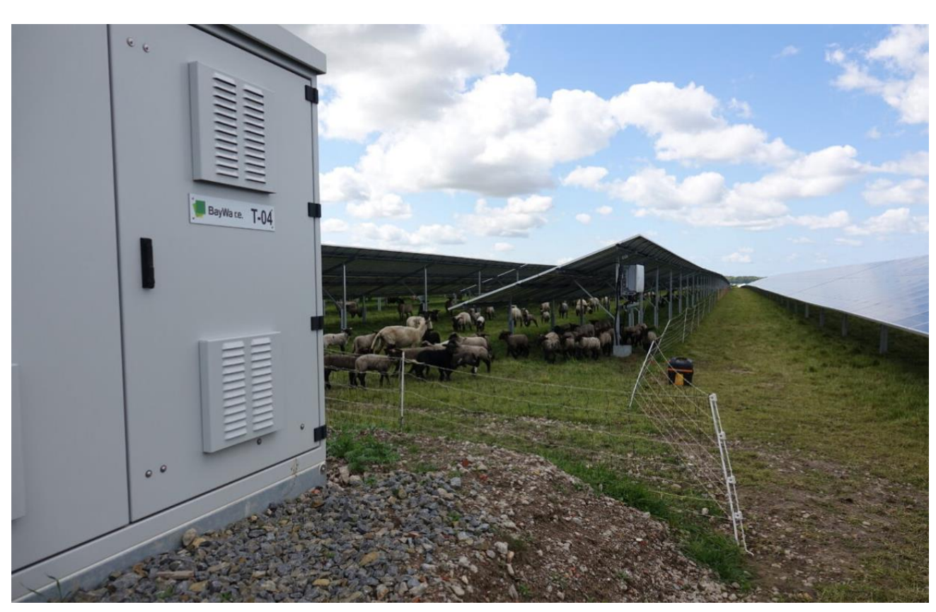
Plate 3: Typical transformer on a solar farm site